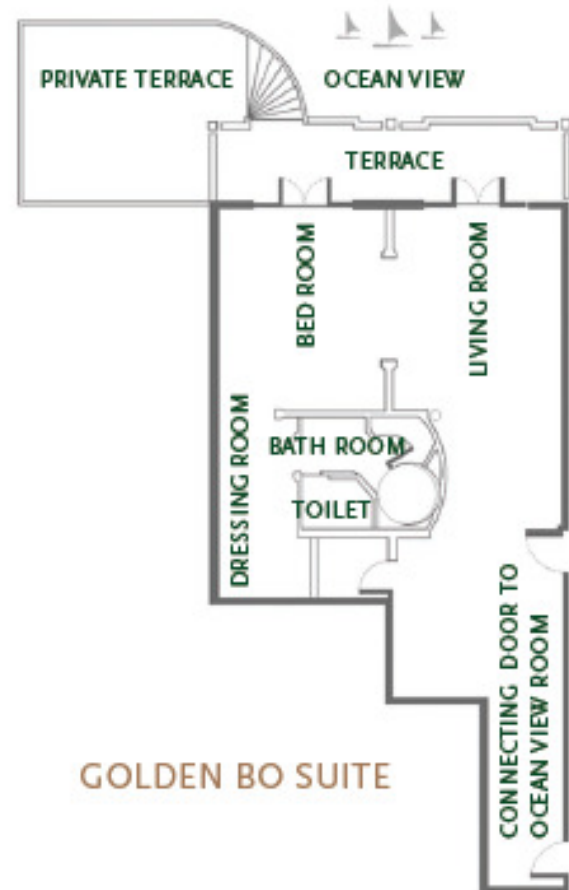
GOLDEN BO SUITE

Located on the ground floor of the central resort building, The suite includes a large living room, dining area and day area which all lead out to the swimming pool and the suite's private outdoor terrace. This private terrace includes an outdoor shower, table and relaxing area all overlooking the Gulf of Thailand. The bedroom and furnishings are decorated with Thai silk. A guest bathroom is included with the suite plus a circular Jacuzzi in the main bath room. There is a separate dressing and wardrobe area leading from the main bedroom giving guests ample space for personal items. Butler Service is provided throughout your stay.