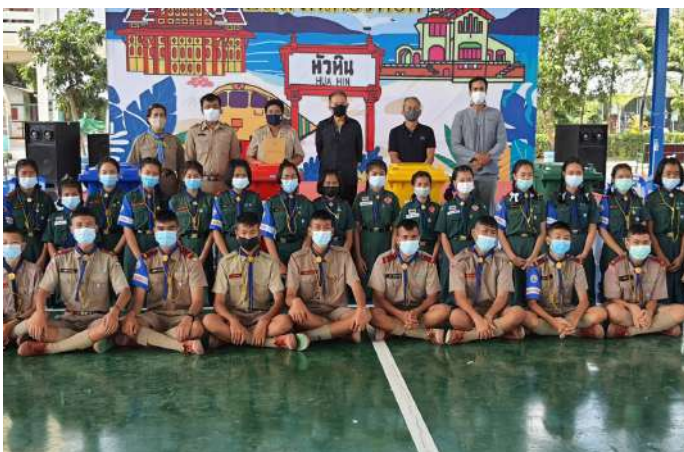
Waste Bins donation at Baan Bor Fai Municipality School in Hua Hin on the 04th February 2021