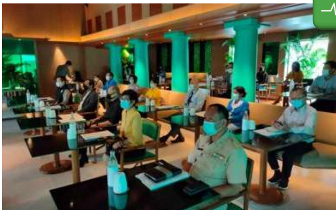
Hua Hin Recharge meeting with hotel representatives, tour operators, government officials from Hua Hin municipality held on the 19th April 2021 at Chiva-Som Resort, Hua Hin.

Chiva-Som has always placed health at the centre of its principles and made a firm decision to lead the way forward in Hua Hin's vaccination efforts for the safety of the resort's staff, guests and residents of Hua Hin. As part of the Hua Hin Recharge project, with the aim of reopening Hua Hin to international travellers from 1st October, Chiva-Som purchased 1,600 doses of Sinopharm vaccines costing THB 1,562,880 from the Chulabhorn Royal Academy and supplied them to Hua Hin Hospital. With this initiative, Chiva-Som has now vaccinated all resort staff along with a number of family members. The remaining vaccines were donated to Hua Hin Hospital to help with vaccinating the local community.