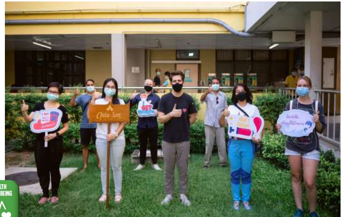
Chiva-Som staff members receiving COVID-19 vaccine at the Hua Hin Hospital on the 05th July 2021