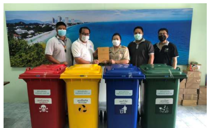
Chiva-Som Staff members and Preserve Hua Hin Group members handing over the waste bins and Sustainable City Development Plan to Khao Phithak Municipality School.

A total of 28 bins were distributed among the seven schools and THB 53,743 was used for the project. We are hoping to expand the project to several other schools in Hua Hin and to conduct more awareness programmes for students. Further activities are planned to revisit the schools and evaluate the status of the waste handling process, and to assist school authorities in strengthening their waste management activities.