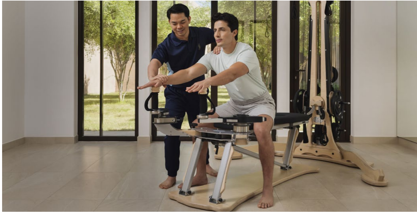
Gyrotonic - Physiotherapy