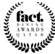
FACT DINING AWARDS – DINING DELIGHTS Green & Clean, Al-Sidr Restaurant Compare Retreats' Luxury