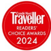
CONDE NAST READERS CHOICE AWARDS Top 10 Best Destination Spas in the rest of the World