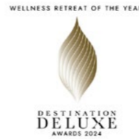
DESTINATION DELUXE AWARDS 2024 Wellness Retreat of the Year