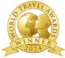
WORLD TRAVEL AWARDS Middle East's Leading Retreat