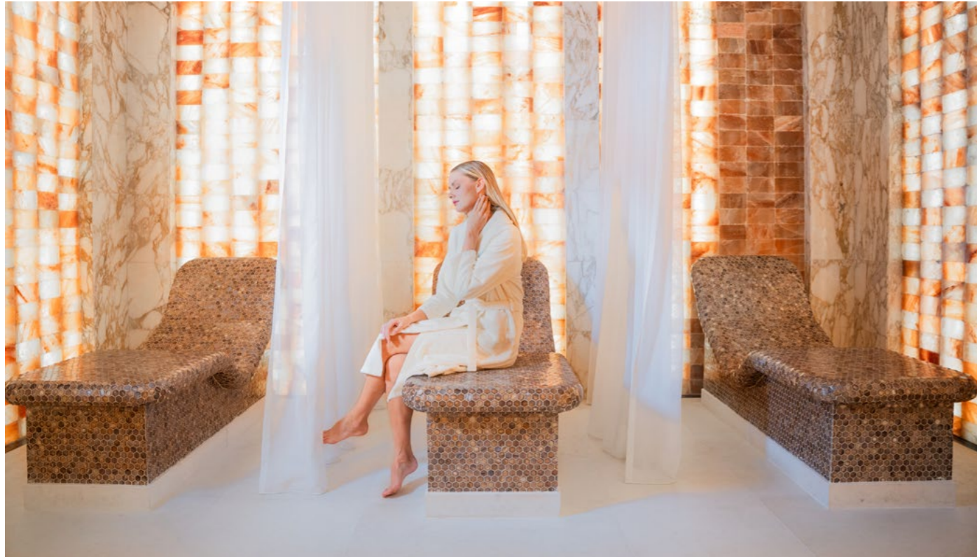
Himalayan Salt Therapy