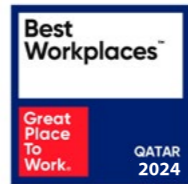
GREAT PLACE TO WORK'S 2024 Best Workplaces™ in Asia List